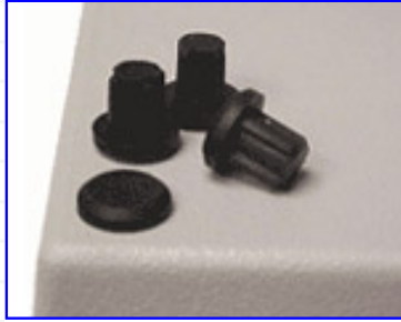
Non-Skid Feet (P/N 51)